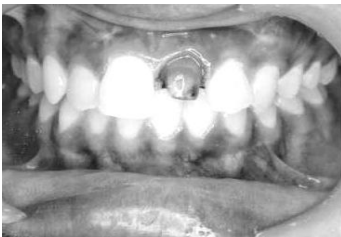
Figure 5: Crown cutting of tooth done (Operative)

After root canal treatment and composite build up of the fractured tooth, crown cutting of the teeth was done as shown in (Figure 5). After the crown cutting impression was taken and sent to the laboratory for the processing of Porcelain fused to metal crown. The crown was fixed with the help of luting cement i.e GIC TYPE 1 as shown in the (Figure 6).