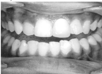
Figure 6: Crown on Fractured Incisor Given (Post – Operative)

After root canal treatment and composite build up of the fractured tooth, crown cutting of the teeth was done as shown in (Figure 5). After the crown cutting impression was taken and sent to the laboratory for the processing of Porcelain fused to metal crown. The crown was fixed with the help of luting cement i.e GIC TYPE 1 as shown in the (Figure 6).