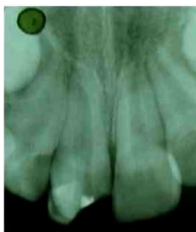
Figure 2: Preoperative IOPA X-ray

The tooth showed negative response to cold and electric pulp sensibility tests. There was no mobility or displacement. The remaining maxillary and mandibular anterior teeth were intact. Periapical radiograph was taken which confirmed pulpal involvement. The apex was fully formed and there was no associated root fracture or periapical pathology. (Figure 2)