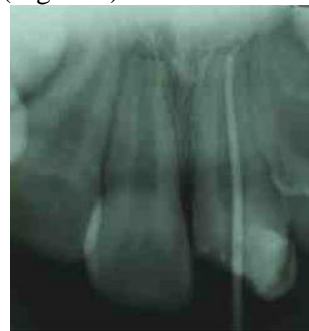
Figure 3: IOPA showing working length x-ray

An infraorbital block was administered for 11, 12. The pulp chamber was opened using no. 330 round carbide steel bur & working length determination IOPA was taken with a no. 10 K-file (Figure 3).