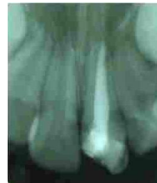
Figure 4: IOPA showing obturation of maxillary left central incisor

The pulp tissue was extirpated using no. 10 – no. 60 K-files. After irrigation with copious amounts of 2.5% NaOCl & Normal Saline, the root canal was dried using paper points. A thin mix of Zinc oxide eugenol paste was mixed and G.P points were coated with Zinc oxide eugenol paste and filled in the canal (Figure 4).