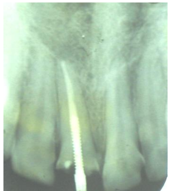
FIGURE 5: IOPA showing prefabricated post adjustment