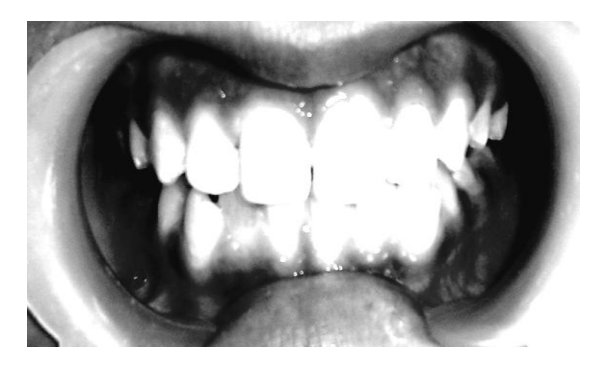
FIGURE 6: Final photograph of the patient with composite build ups in left and right central incisor and crown placement in left lateral incisor