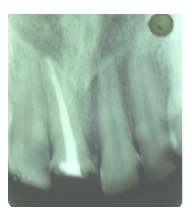
FIGURE 4: IOPA showing obturation of left lateral incisor