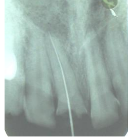
Figure 3: Working length X-ray of left lateral incisor taken