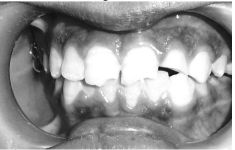
Figure 1: fracture in the middle third of maxillary left lateral incisor along with incisal fracture of maxillary right and left central incisor

After root canal treatment and post adjustment of the fractured tooth, crown cutting of the teeth was done as shown in (Figure 5). After the crown cutting impression was taken and sent to the lab for the processing of Porcelain fused to metal crown. The crown was fixed with the help of luting cement i.e GIC TYPE 1 as shown in the (Figure 6).