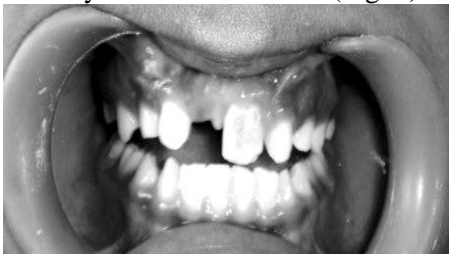
Figure 1: Preoperative photograph of the patient showing unerupted right maxillary central incisor and hypoplastic left maxillary central incisor

A 10-year-old boy came to Dr Harvansh Singh Judge Institute Of Dental Sciences ,Panjab Univeresity, Chandigarh with a chief complaint of the noneruption of right central incisor. His past dental history revealed that at 2 years of age he had injured his primary maxillary central incisors during play at play school. After the injury, he had emergency treatment that involved suturing the lip and antibiotics at a hospital, but no professional dental treatment. Other medical records revealed that he had no general pathologic condition. Clinical examination revealed that the patient had an unerupted permanent maxillary right central incisor, crown malformation and enamel hypoplasia of the permanent maxillary left central incisor. (Fig. 1).