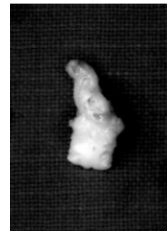
Figure 3: Figure showing extraction of the unerupted central right incisor