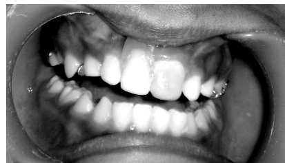
Figure 5: Figure showing removable partial prosthesis placed with respect to maxillary right central incisor