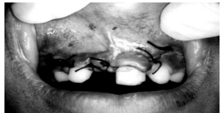
Figure 4: Figure showing sutures placed