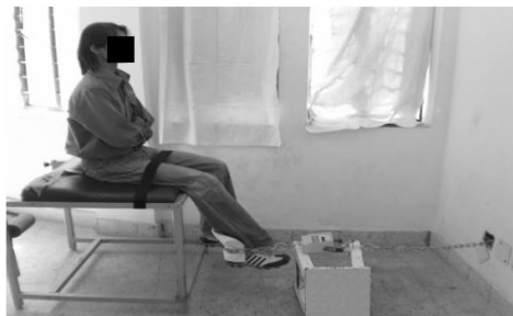
Figure 1: Measurement of isometric contraction of Hamstring muscle

bed sheet was kept below the knee to put it in 20 degrees of flexion. Strain gauge was attached to subject's foot. Ankle was kept at neutral position, having 90 degrees angle between foot and leg.