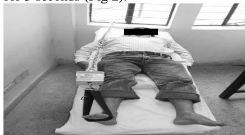
Figure 2: Measurement of isometric contraction of Calf muscle

Subjects were asked to plantar flex the foot with maximum effort and hold it for 5 seconds (Fig 2).