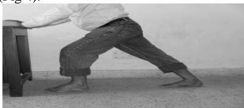
Figure 4: Subject doing self stretching of calf muscle (Runners' stretch)

(B). For calf stretching: Subjects were made to stand in walk standing position with right lower limb behind the left. Knee of the right lower limb was kept extended; subjects leaned forward over a couch, with foot completely in contact with the ground. They were asked to lean forward till they felt the stretch in calf region but not pain (Fig 4).